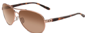
FEEDBACK Rose Gold/VR50 Brown Gradient SKU: 004079-01