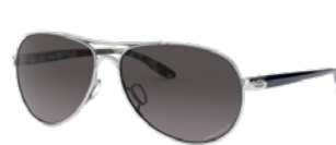
POLARIZED FEEDBACK Polished Chrome/Prizm Gray Gradient Polarized SKU: 004079-4059