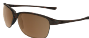
POLARIZED UNSTOPPABLE Matte Tortoise/Prizm Tungsten Polarized SKU: 009191-1465