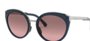
TOP KNOT Midnight/G40 Black Gradient SKU: 009434-0356