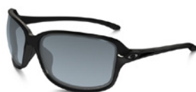
COHORT Polished Black/Gray Gradient SKU: 009301-04