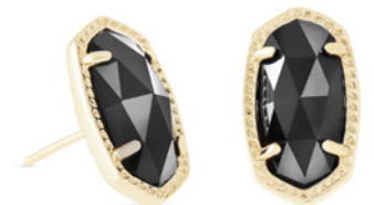
ELLIE STUD EARRINGS Gold/Black SKU: 4217711849