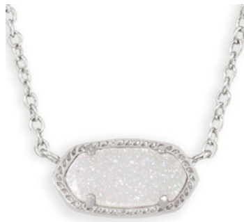
ELISA NECKLACE Rhodium/Iridescent Drusy SKU: 4217711459