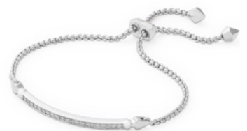
OTT CHAIN BRACELET Rhodium SKU: 4217715265