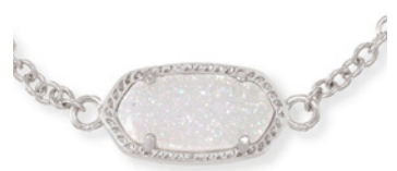
ELAINA CHAIN BRACELET Rhodium/Iridescent Drusy SKU: 4217714526