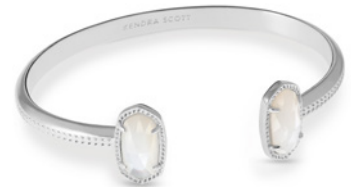
ELTON CUFF BRACELET Rhodium/Ivory Mother of Pearl SKU: 4217715828