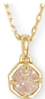
NOLA PENDANT NECKLACE Gold/Iridescent Drusy SKU: 4217704873