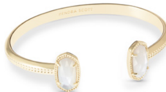
ELTON CUFF BRACELET Gold/Ivory Mother of Pearl SKU: 4217712707