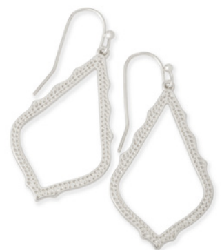
SOPHIA DROP EARRINGS Rhodium SKU: 4217714498