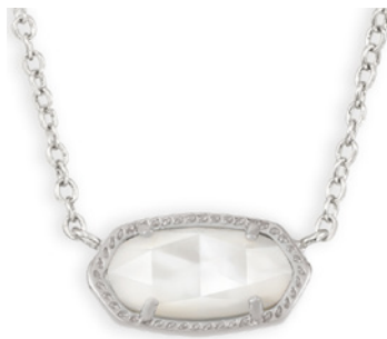
ELISA NECKLACE Rhodium/Ivory Mother of Pearl SKU: 4217715820