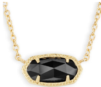
ELISA NECKLACE Gold/Black SKU: 4217711235