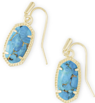
LEE DROP EARRINGS Gold/Bronze Veined Turquoise SKU: 4217716048