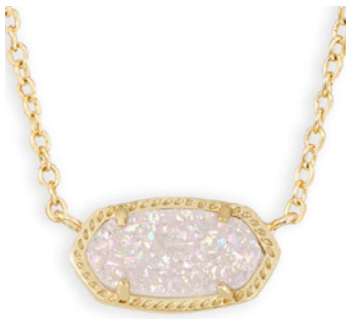
ELISA NECKLACE Gold/Iridescent Drusy SKU: 4217709208