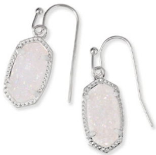
LEE DROP EARRINGS Rhodium/Iridescent Drusy SKU: 4217711449