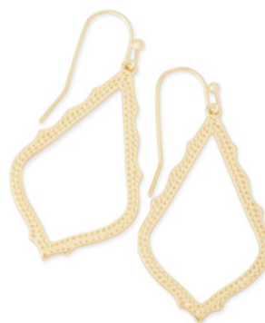
SOPHIA DROP EARRINGS Gold SKU: 4217714497