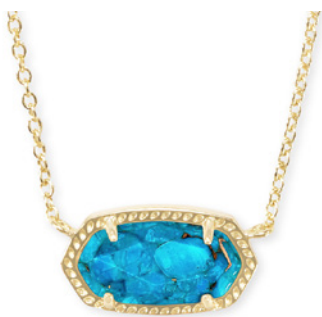
ELISA NECKLACE Gold/Bronze Veined Turquoise SKU: 4217714790