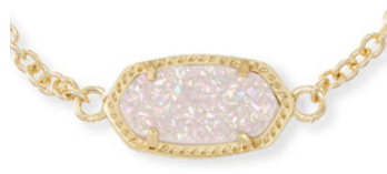
ELAINA CHAIN BRACELET Gold/Iridescent Drusy SKU: 4217714522