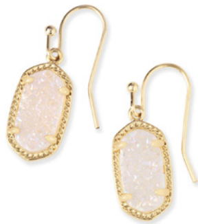
LEE DROP EARRINGS Gold/Iridescent Drusy SKU: 4217711447