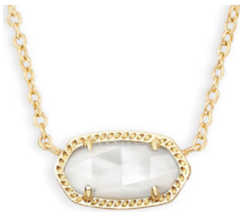
ELISA NECKLACE Gold/Ivory Mother of Pearl SKU: 4217711454