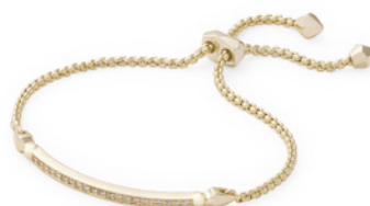
OTT CHAIN BRACELET Gold SKU: 4217715263