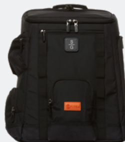
STITCH BIRDIE BAG Black SKU: BB-BK