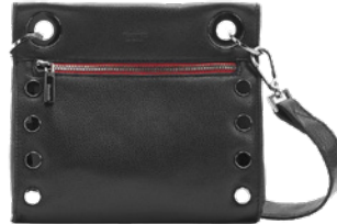
HAMMITT TONY SMALL LEATHER CROSSBODY BAG Black/Gunmetal/Red Zip SKU: TONYSML-BLK-GMR