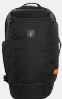
STITCH TRAVELER BACKPACK Black SKU: TBP-BK