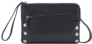
HAMMITT NASH SMALL LEATHER CLUTCH/WRISTLET Black/Gunmetal SKU: NASHSML2-BLACK