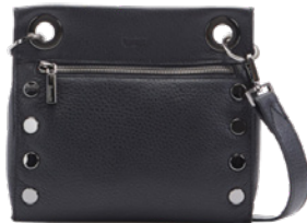
HAMMITT TONY SMALL LEATHER CROSSBODY BAG Black/Gunmetal SKU: TONYSML-BLK-GM