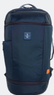
STITCH TRAVELER BACKPACK Navy SKU: TBK-NVY