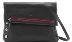
HAMMITT VIP MEDIUM FUNCTIONAL LEATHER CLUTCH Black/Gunmetal/Red Zip SKU: VIPMED-BLK-GMR-ZIP