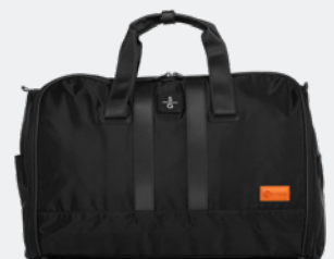
STITCH CLUBHOUSE DUFFLE Black SKU: CD-BK