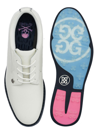
WOMENS GALLIVANTER GOLF SHOE Snow SKU: G4LC0EF02

WOMENS PERFORATED MG4+ GOLF SHOE Blush SKU: GLF000009