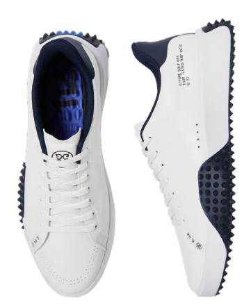
MEN'S G.112 P.U. GOLF SHOE Snow/Twilight SKU: GMF000027

MENS CONTRAST SOLE MG4+ GOLF SHOE Snow SKU: G4MA23EF25