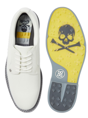
MENS GALLIVANTER GOLF SHOE Snow/Monument SKU: GMF00001